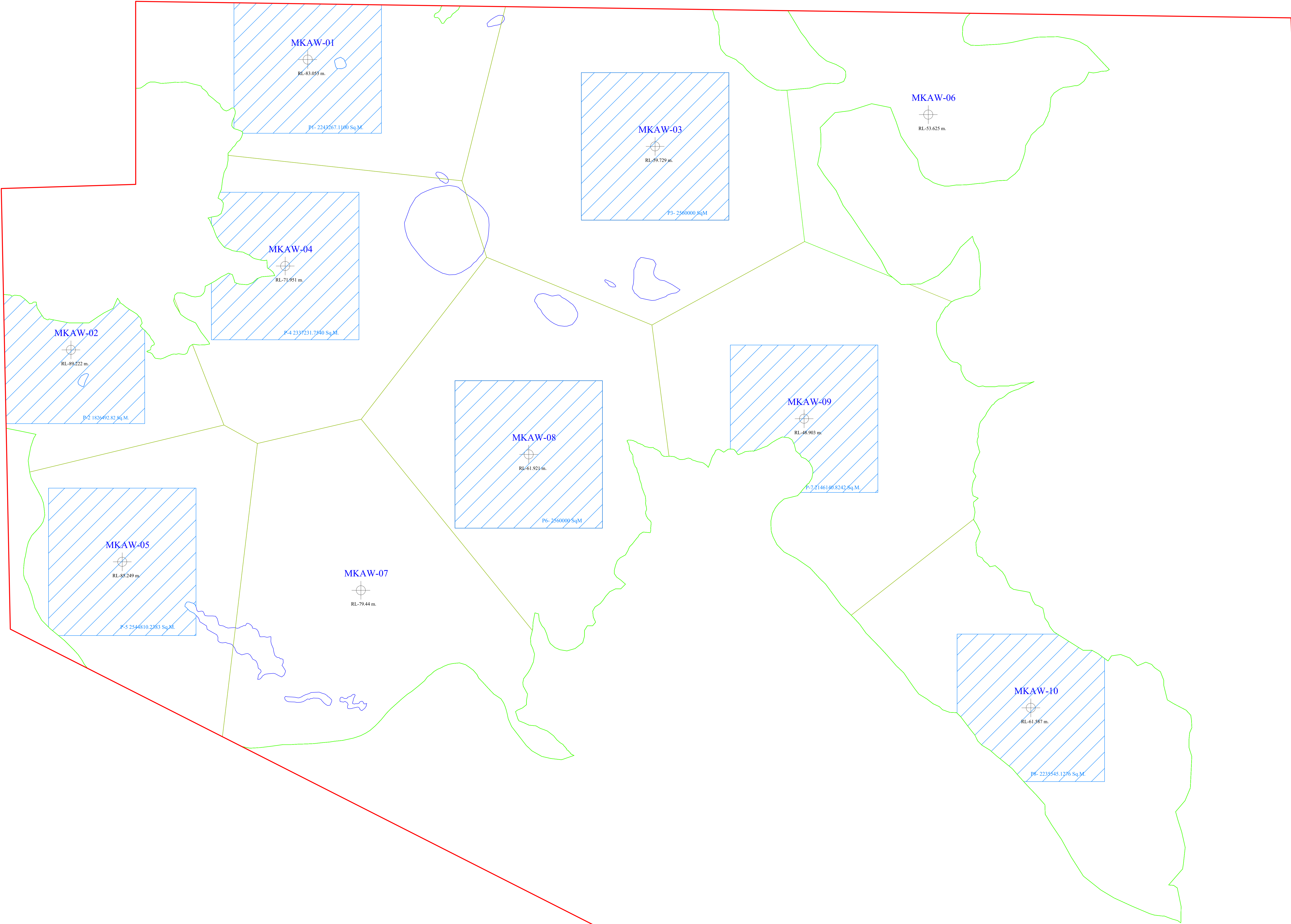
Borehole-wise, Cumulative Mineralised Zone Details in Ambara West Block, Kachchh District, Gujarat